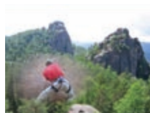
Custom transparency mask